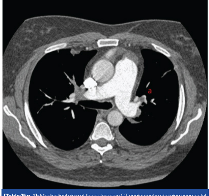
[Table/Fig-1]: Mediastinal view of the pulmonary CT angiography showing segmental PE in the left lung (a)

Considering stable vital sign and an estimation of intermediate-low risk for his acute PTE, he was candidate for anticoagulant therapy. His clinical course was uneventful and after 10 days of treatment with heparin and warfarin the RV size and function improved significantly, TRG reduced to 40 mmHg and the RV thrombus was decreased in size (1cm X 2cm) and appeared immobile and fixed in the lateral papillary muscle. On follow-up after a month he was doing well.